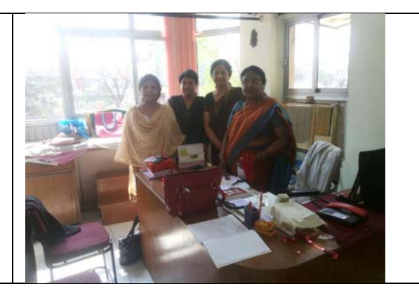
ISOPARB Executive Board Meeting / General Body Meeting was held on 27<sup>th</sup> February, 2017 at Hotel Maurya, Patna. Office bearers of ISOPARB were present.