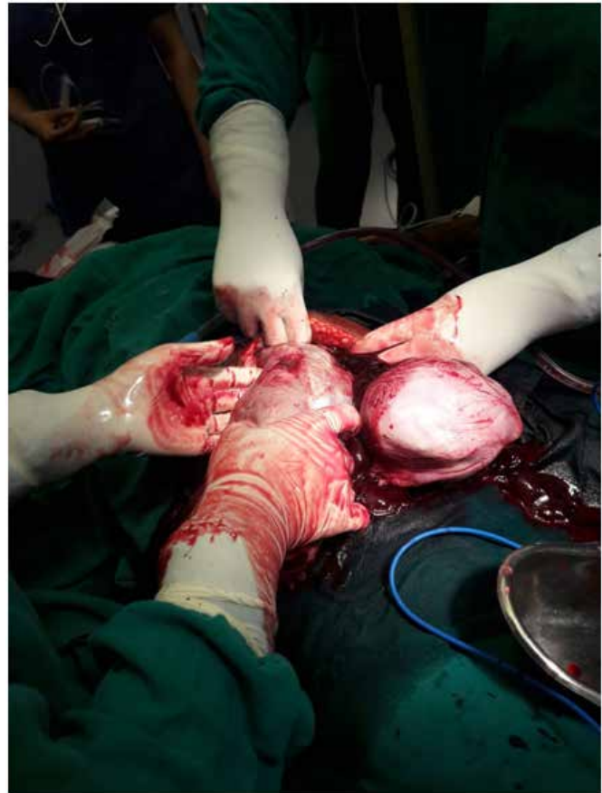
Figure 2: A dead macerated baby weighing 1.9 kg, along with placenta, was removed from the peritoneal cavity.

which she was taken to a district hospital where she was taken up for emergency cesarean section. Probably, the doctor might have encountered difficulty to deliver the baby, which might have led him to convert the lower segment uterine incision into an upper segment inverted 'T' shaped incision. This in her current pregnancy would have made her highly susceptible to uterine rupture. The patient had presented to us for the first time in state of shock. The woman and her relatives in this case had to face the trauma of peripartum hysterectomy and fetal loss owing to their ignorance. Delay in seeking appropriate medical care in both her pregnancies made her lose her two babies and ended up with her hysterectomy, with her having no living issue and unfortunately no chance of future pregnancy.