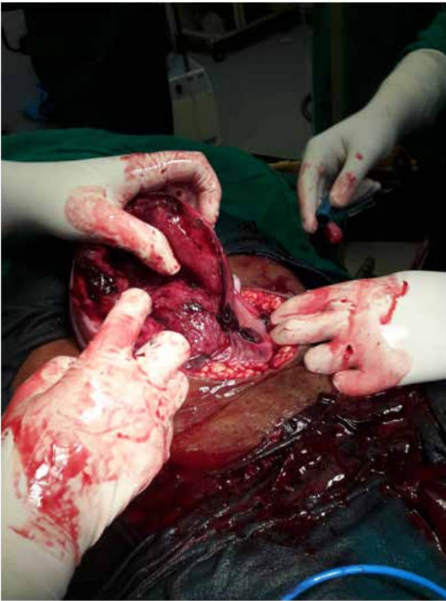
Figure 1: A midline longitudinal anterior uterine wall rupture 14 – 15 cm in length noted extending from fundus upto utero-vesical fold. Also ,a transverse rupture, at site of previous lower segment cesarean scar was noted, hence giving characteristic inverted 'T' shape to the uterine rupture.

which she was taken to a district hospital where she was taken up for emergency cesarean section. Probably, the doctor might have encountered difficulty to deliver the baby, which might have led him to convert the lower segment uterine incision into an upper segment inverted 'T' shaped incision. This in her current pregnancy would have made her highly susceptible to uterine rupture. The patient had presented to us for the first time in state of shock. The woman and her relatives in this case had to face the trauma of peripartum hysterectomy and fetal loss owing to their ignorance. Delay in seeking appropriate medical care in both her pregnancies made her lose her two babies and ended up with her hysterectomy, with her having no living issue and unfortunately no chance of future pregnancy.